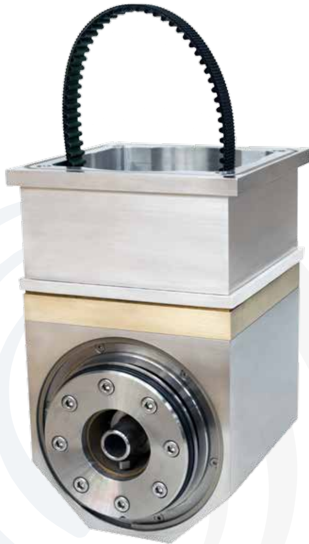
Patented SC end block