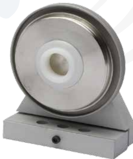
Outboard support assembly