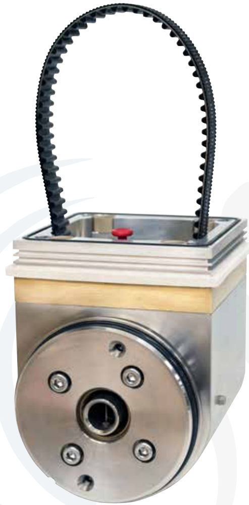
Patented MC end block