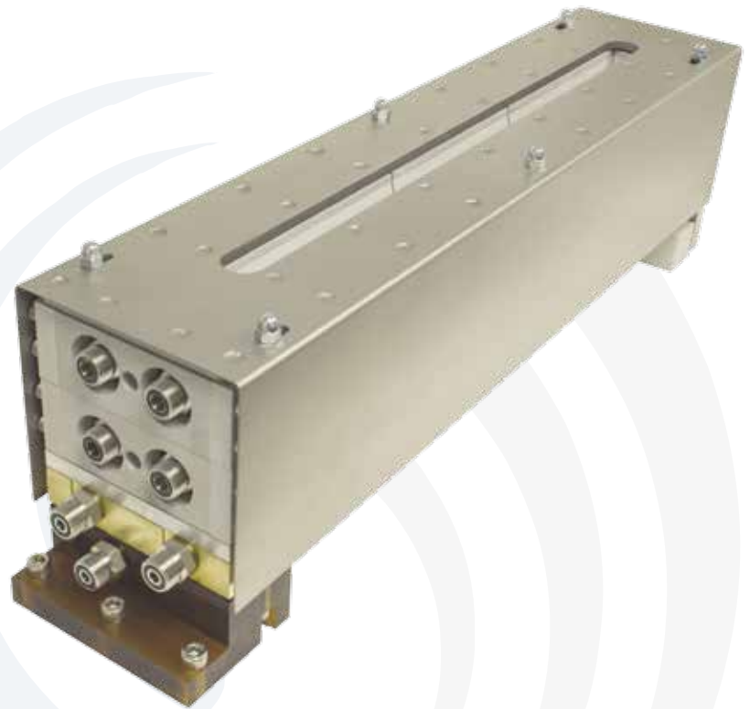
envis-ION™ Dual Magnetron Pre-treatment Source (DMPTS)